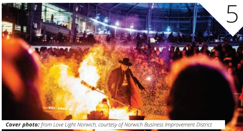
Cover photo: from Love Light Norwich, courtesy of Norwich Business Improvement District